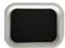
Plastic Drip Trays