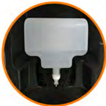
Internal Auto Dispenser