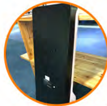
Back View Metal Housing