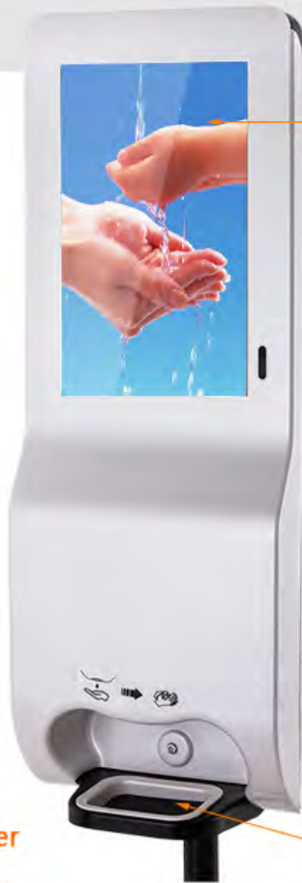
21.5" WiFi Video Player