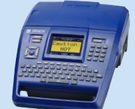
BMP®71 Label Printer ($895)

Higher volumes of labels with more advanced text and formatting on die-cut and continuous supplies for wire and cable, electrical and automation panels, datacomm and general ID. Features a color touch screen, QWERTY keyboard, USB connectivity, optional Wi-Fi, list management. 2 in. max width.