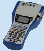
BMP®41 Label Printer ($299)

Basic labels on continuous supply for wires and cables, panels, datacomm, as well as misc. industrial labels in operations, maintenance and production areas. 0.75 in. max width.