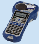
BMP®21-LAB Printer ($99)

Basic labels on continuous supply for Laboratory ID including vials, tubes, slides, plates, bottles and labels for lab equipment, storage shelves, drawers, bins, cryo, deep freezer and autoclave labels. 0.75 in. max width.