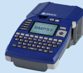
BMP®51 Label Printer ($430)

Labels with more advanced text and formatting on die-cut and continuous supplies for wires and cables, electrical and automation panels and datacomm, as well as misc. industrial labels in operations, maintenance and production areas. 1 in. max width.