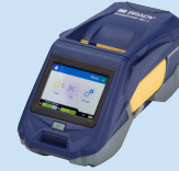
BradyPrinter M611 Label Printer ($675)

Labels with more advanced text and formatting on die-cut and continuous supplies for wires and cables, electrical and automation panels and datacomm, as well as misc. industrial labels in operations, maintenance and production areas. 1.5 in. max width.