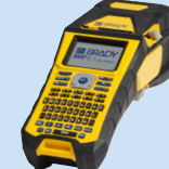
BMP®61 Label Printer ($725 / $775)

Higher volumes of labels with more advanced text and formatting on die-cut and continuous supplies for wire and cable, electrical and automation panels, datacomm and general ID. Runs on external Brady Workstation mobile or desktop software. Features a color touchscreen with material monitoring, Wi-Fi and Bluetooth connectivity, USB 2.0 port. 2 in. max width.