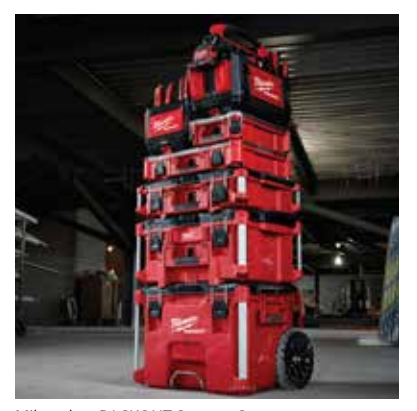
Milwaukee PACKOUT Storage System

LIS offers flexible solutions that are built around the needs of your business, from the smallest daily needs to larger everyday warehousing needs.